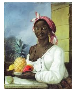
François Malépart de Beaucourt, "Portrait of a Haitian Woman" (formerly Portrait of a Negro Slave until 2011) [1786], oil on canvas, 72.7 x 58.5 cm., M12067, McCord Museum, Montreal.