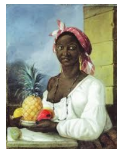
François Malépart de Beaucourt, "Portrait of a Haitian Woman" (formerly Portrait of a Negro Slave until 2011) [1786], oil on canvas, 72.7 x 58.5 cm., M12067, McCord Museum, Montreal.